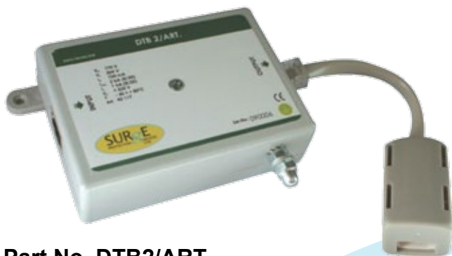
Part No. DTB2/ART

For BT Type Sockets. Test category D+C+B to BSEN 61643-21